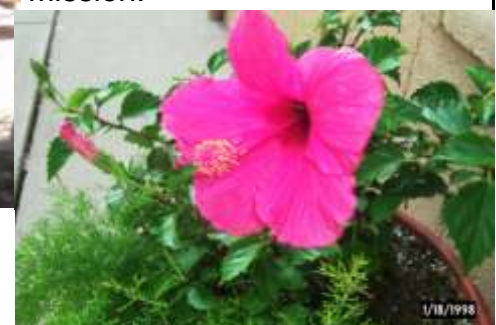
Photos on this page taken by the children at Union Gospel Mission Photography for Gardeners Class

The proceeds from the sale of the 2010 calendar will be used for more cameras to use in future photography classes for the residents of Union Gospel Mission.