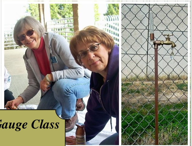
Copper Rain Gauge Class at Union Gospel Mission