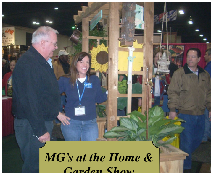
MG's at the Home & Garden Show