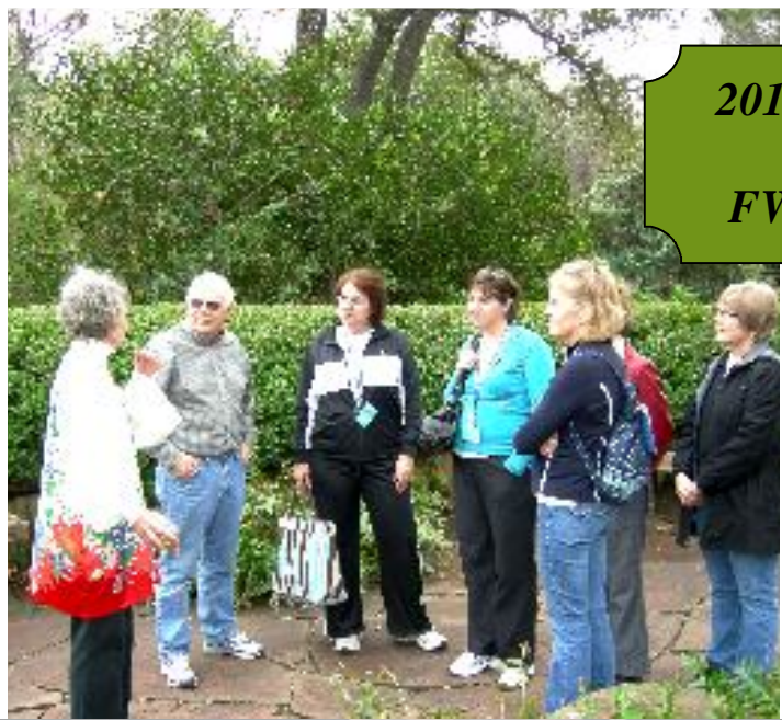
2010 Intern Field trips to BRIT and FW Botanic Japanese Garden