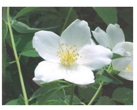
Sweet Mock Orange

Try planting white varieties of iris, lilies, zinnias, or Shasta daisies along with silver-leafed plants like Artemisia, Dusty Miller, Lamb's Ear, or Japanese Silver Grass for a pleasing effect. Impatiens, petunias and begonias can be used also.