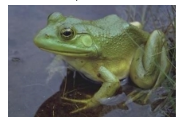
(Continued on page 7)