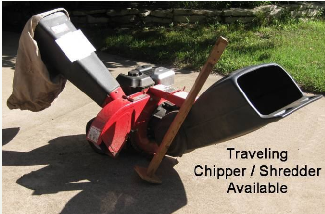
Traveling Chipper / Shredder Available

Need a chipper/shredder, but are they too expensive for one person to buy? Join the Tribe of the Traveling Chipper. Here's the deal – a Master Gardener left this when she moved away with instructions that anyone who needed it could use it and then pass it to the next MG as needed. So, if you want to use it, you get to keep it until the next MG wants it. It can even live at one of the projects that has a storage shed.