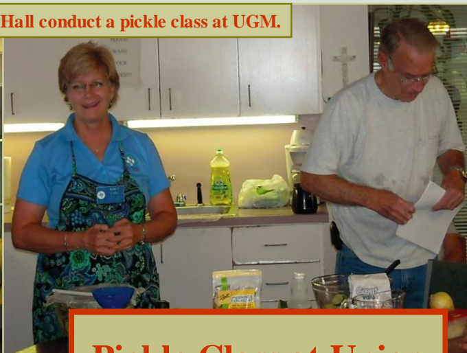
Pickle Class at Union Gospel Mission