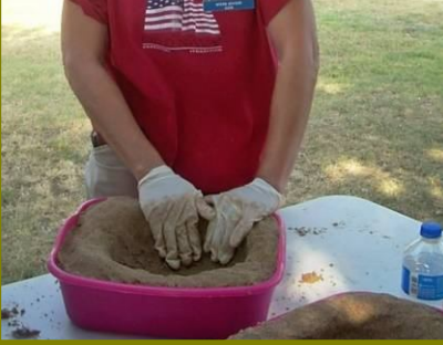
STEP 3: form mold