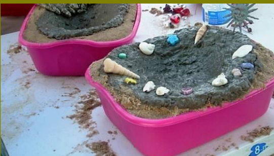
Some of the finished products!