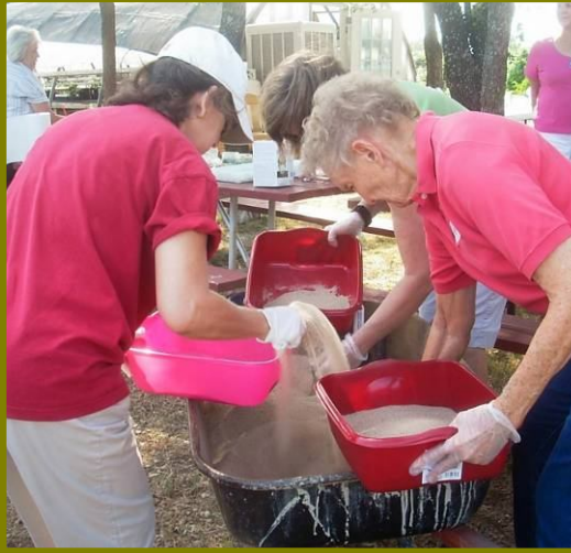
STEP 1: fill tub with sand