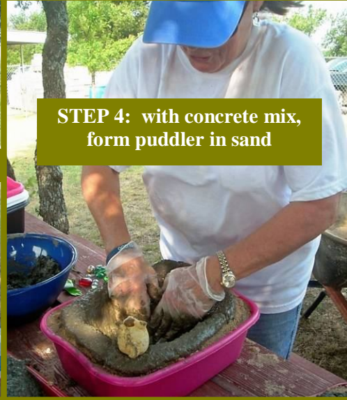
STEP 4: with concrete mix, form puddler in sand