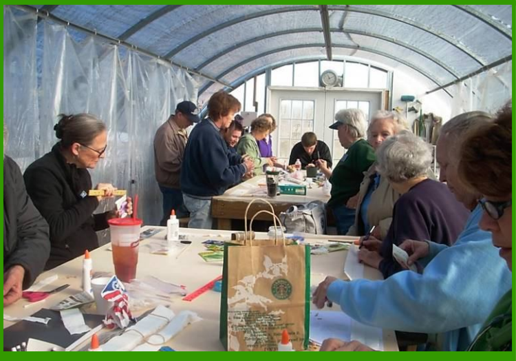
The seed propagation class.