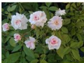
Cecile Brunner * Bloom color- Light Pink Bloom Type - Semi-Double Blooming Period-Repeat Bloom - Spring - Frost Mature H x W 3 x 5' Rose Category - Polyantha Also known as "The Sweetheart Rose"