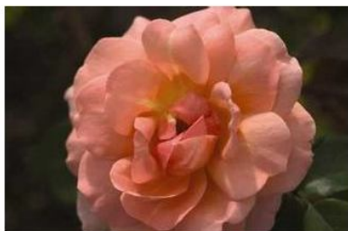
Sweet Fragrance Bloom color-Apricot/Pink Blend Blooming Period-Repeat Blooms Mature H x W - 4' x 3' Rose Category-Grandiflora Spreading shrub that produces a lot of color