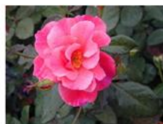
Cinnamon Spice*** Bloom color- Salmon/Orange/Red Blend Bloom Type - Double Blooming Period-Repeat Bloom - Spring - Frost Mature H x W 3 x 4' Rose Category - Shrub Buck Rose