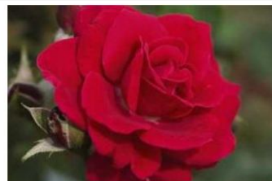
Super Hero Bloom color-Medium Red Blooming Period-April-Nov Mature H x W - 5' x 3' Rose Category-Floribunda Introduced in 2008 Compact growth, good for borders