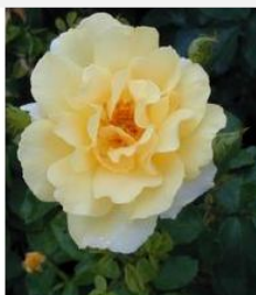
Summer Honey *** Bloom color-Yellow/Amber Blend Blooming Period-Repeat Double Mature H x W - 5' x 4' Rose Category-Shrub Buck Rose