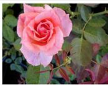
Freckles *** Bloom color- Pink Blend Bloom Type-Double; repeats later in season Blooming Period-Compact, clusters almost continual bloom Mature H x W - 3' - 4' x -4' - 5' Rose Category-Shrub Buck Rose, introduced in 1976