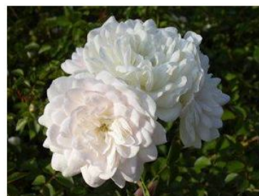
Sea Foam * Bloom color-Creamy White Blooming Period-Repeat Blooms Spring-Frost Mature H x W - 2' - 6' x 4' - 8' Rose Category-Shrub Climber