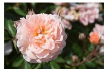
Apricot Drift ** Bloom color- Apricot Foliage - dark green, glossy Mature H x W- 1½' x 2 1/2' Rose Category-Shrub Very resistant to disease Introduced 2010