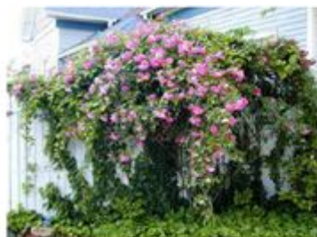
Climbing Pinkie * Bloom color-Rose Pink Bloom Type-Semi-Double Blooming Period-April-Nov Mature H x W-8'-12' x 6' Rose Category-C1 Polyantha Climber