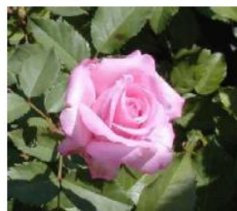
Belinda's Dream * Bloom color- Pink Blooming Period-April-Nov. Mature H x W 3'-6' x 3'-4' Rose Category-Shrub Nicknamed "rose of the 20 th Century" Texas Superstars