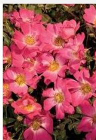
Pink Drift ** Bloom color- Deep Pink Foliage – medium green Mature H x W - 1½' x 3' Rose Category-Shrub Very resistant to disease Introduced 2006