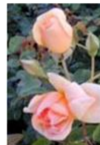
Crepuscule Bloom color-Apricot/Yellow Bloom Type-Semi-Double Blooming Period-Blooms in finishes throughout season Mature H x W-6'-12' x 6' Rose Category- Noisette Introduced 1904