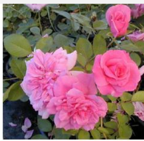
Prairie Breeze Bloom color-Mauve Blooming Period-Repeat bloom Mature H x W - 3' x 3' Rose Category-Shrub Fragrance-Spicy Erect growth, bushy and slightly spreading