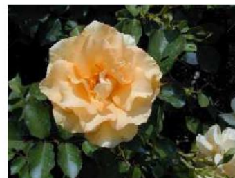
Winter Sunset *** Bloom color- Yellow/Orange Blooming Period – Repeat, blooms in clusters of 3-7 Mature H x W - 3½' x 3' Rose Category-Shrub; Upright, bushy growth Buck Rose, introduced 1997; Also known as Fuzzy Navel