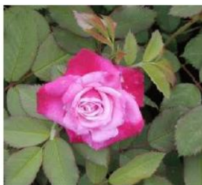
Archduke Charles Bloom color-Crimson outer petal to pale pink center Bloom Type-Single Blooming Period-Repeat Bloom Spring - Frost Mature H x W-3'-5' x 3'-4' Rose Category-China Introduced prior to 1837; Colors change as it ages, appears to grow several different colors at the same time. Often found in old cemeteries

Planting Guide: Prepare planting bed with expanded shale; add 3" mulch after planting; water twice a week.