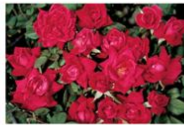
Knock-Out Double Red Bloom color- Median Red Bloom Type-Double blooms in clusters Blooming Period-Spring-Fall Mature H x W - 3' - 4' x 3' - 4' Rose Category - Shrub