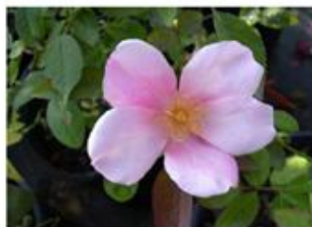
Mutabilis * Bloom color- Yellow/Pink/Orange Bloom Type-Single Blooming Period-April-Nov Mature H x W - 4' - 10' x 6' Rose Category-China Large Shrub Earth Kind Rose of the Year 2005