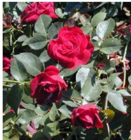
Red Fountain Bloom color-Red Bloom Type-Semi-Double Blooming Period-Repeat Spring - Frost Mature H x W - 12' x 14' Rose Category-Climber Introduced in 1975 Blooms on new and old wood