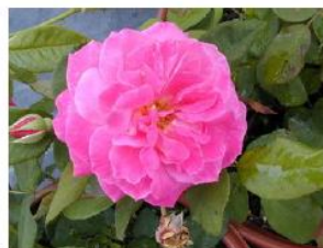
American Legacy *** Bloom color-Deep Pink Bloom Type-Double Mature H x W 3' x 3' Rose Category-Shrub Buck Rose