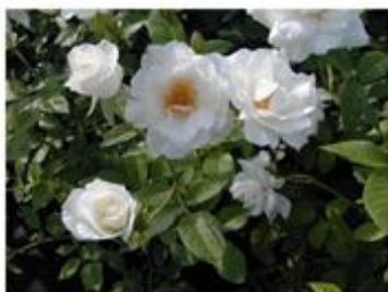
Iceberg Bloom color-Pure white Bloom Type-Double in large clusters Vigorous growth, upright, bushy and tall Mature H x W - 3' - 5' x 3' - 6' Rose Category-Floribunda Introduced in 1958