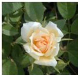
Jefferson/Softie Bloom color-Creamy Yellow Blooming Period-Repeat Bloom - Spring-Frost Mature H x W - 2' - 3' x 2' - 3' Rose Category-Shrub March Chamblee found this rose along the road in Jefferson, TX. Rarely without bloom. "Bulletproof" rose. Can grow in poor soil. Has cascading growth habit. Semi-thornless.