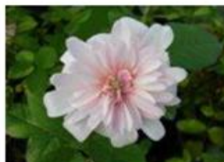
Perle d'Or * Bloom color-Apricot Yellow Bloom Type-Semi-Double Blooming Period-Repeat Bloomer Mature H x W - 3' - 6' x 3' - 4' Rose Category-Polyantha Small Shrub Earth Kind Rose of the Year 2007