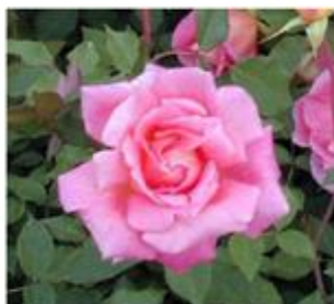
Comtesse du Cayla Bloom color-Orange-Red Shows two colors at once. Blooming Period- Repeat, blooms from spring-frost Mature H x W - 3'- 4' x 3' - 3' Rose Category- China Introduced 1902 Named for the mistress of Louis XVIII. Good for containers or small beds.