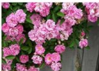
Peggy Martin Bloom color-Pink Blooming Period-Repeat Bloomer Spring-Frost Mature H x W - 6' - 10' x 12' - 15' Rose Category-Climber Rose survived Hurricane Katrina Percentage of proceeds goes to New Orleans horticulture restoration