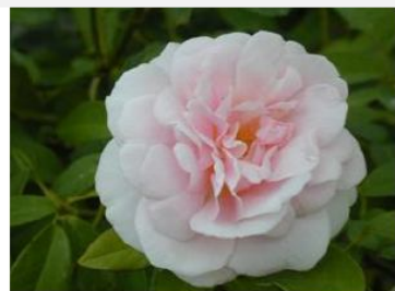
Spice * Bloom color-Blush Pink Blooming Period-Spring-frost in clusters Mature H x W - 3' - 5' x 3' - 4" Rose Category-China Light, spice fragrance This is one of the Bermuda "mystery roses"