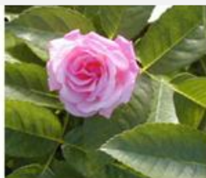
Marie Daly * Bloom color-Pink Bloom Type-Double Blooming Period-April-Nov Mature H x W - 3' - 4' x 3' - 4' Rose Category-Polyantha Texas Superstar