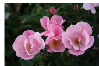
Blushing Knock-Out Bloom color-Light Pink Bloom Type-Single Blooming Period-Spring - Frost Mature H x W-3' - 6' x 3' - 4' Rose Category-Shrub