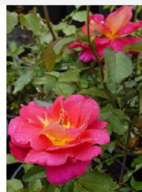
Prairie Sunset *** Bloom color-Yellow blend Blooming Period-Repeat, in clusters 5-10 Mature H x W - 4' x 3' Rose Category-Shrub Large, pointed soft yellow buds open to double blooms with vermillion red edged petals. The petal face is rose, with deep purple veins.