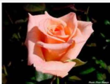
Flamingo Kolorscape Bloom color-Hot Pink Bloom Type-Single Blooming Period-April-Nov Mature H x W - 3' x 3' Rose Category-Shrub Kordes Rose, introduced 2012