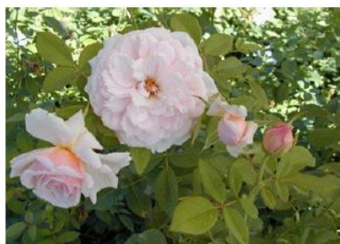
Quietness *** Bloom color-Light Pink Blooming Period-Repeat blooms Mature H x W - 4' x 3' - 4" Rose Category-Shrub Buck Rose