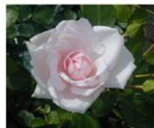
New Dawn * Bloom color-Blush Pink Blooming Period-Repeat Bloom Spring - Fall Mature H x W -15' - 20' x 8' - 20' Rose Category-Large Flowered Climber Awarded first plant patent Voted World's favorite 1997