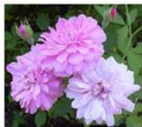
Caldwell Pink * Bloom color-Lilac Pink Bloom Type-Double Blooming Period-May-Nov Mature H x W-3'-4' x 3' Rose Category-China