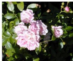
The Fairy * Bloom color-Light Pink Blooming Period-April-Nov Mature H x W - 2' - 4' x 4' Rose Category-Polyantha Dwarf Shrub