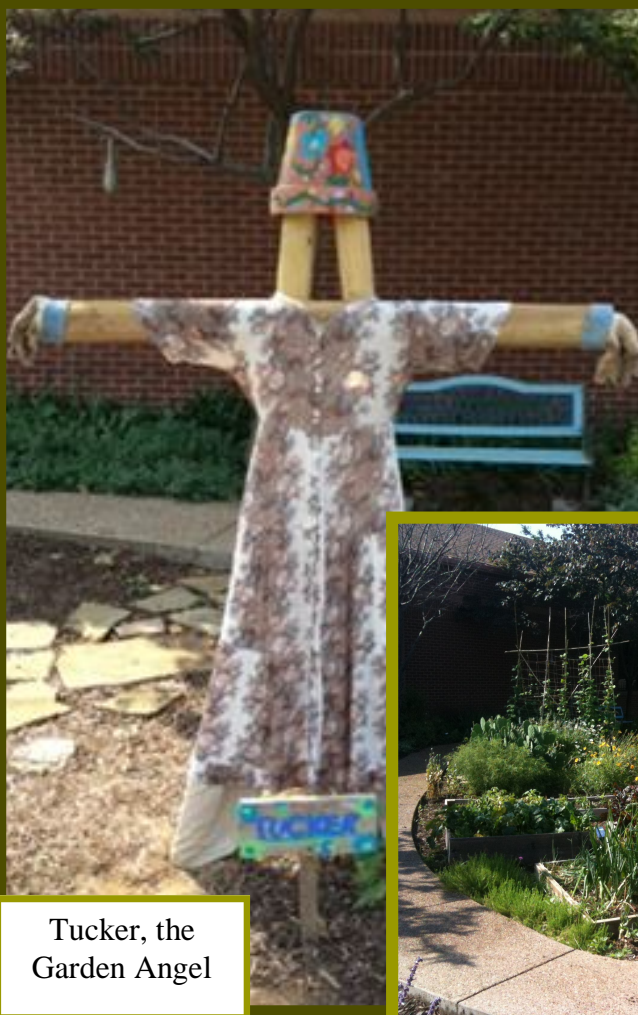
Tucker, the Garden Angel