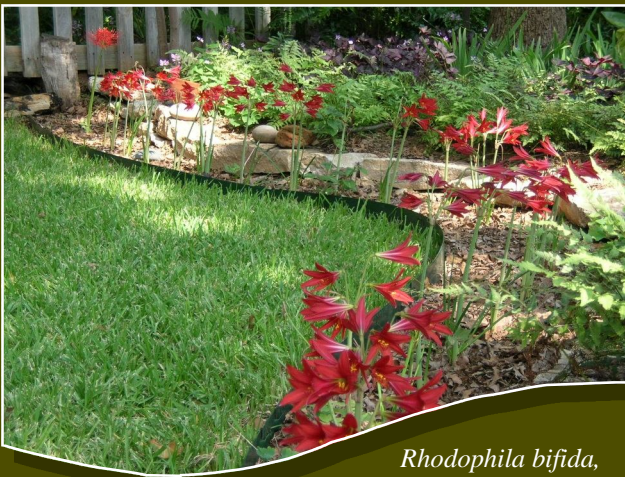
Rhodophila bifida , the Oxblood Lily in Jeanie's garden