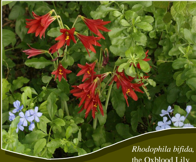
Rhodophila bifida , the Oxblood Lily