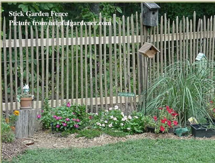
Stick Garden Fence Picture from helpfulgardener.com