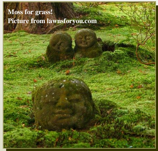
Moss for grass! Picture from lawnsforyou.com

With a lot of imagination, whole scenes can be recreated in your mini garden: sticks become fences, sand and pebbles become streams and moss looks like grass. Just let your love of nature go wild. Finally, sit back and enjoy your creation and be sure to share pictures with family and friends.