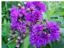
Vernonia baldwinii Western Ironweed

Where: Randol Mill Park Greenhouse 1901 W Randol Mill Rd. Arlington, TX (The greenhouse is in the rear of the park behind the swimming pool.)