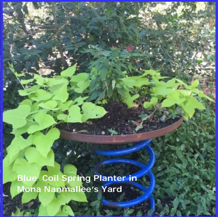
Blue Coil Spring Planter in Mona Nanmallee's Yard