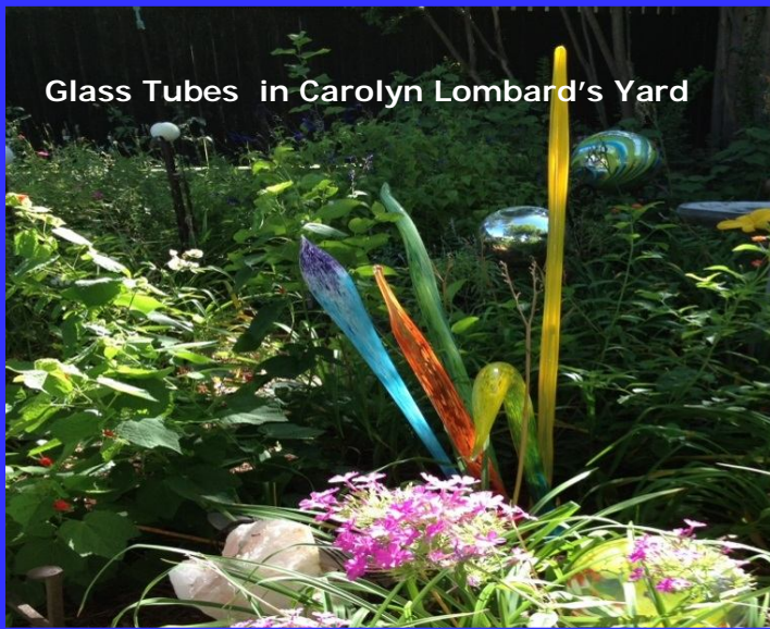
Glass Tubes in Carolyn Lombard's Yard