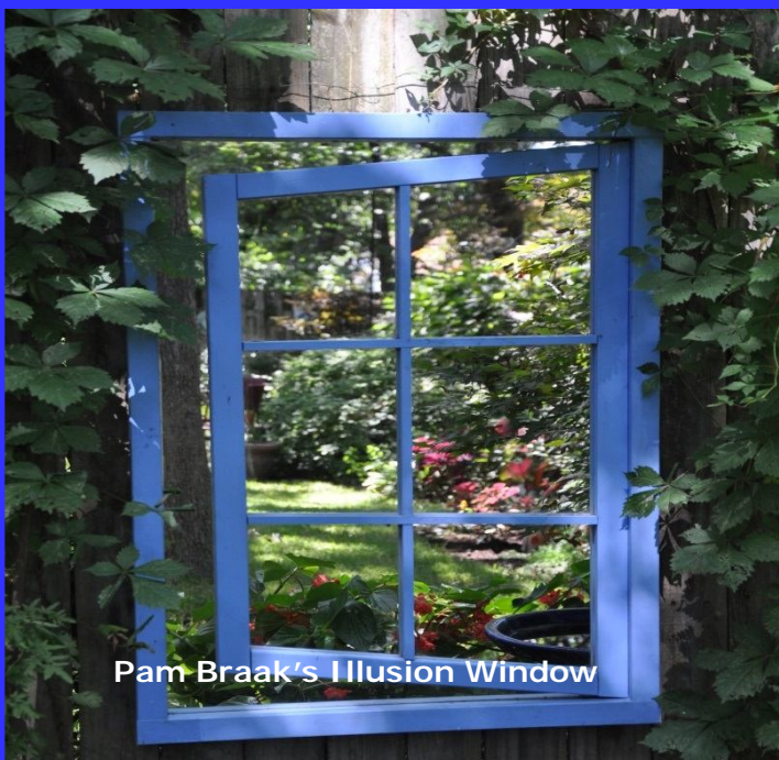
Pam Braak's Illusion Window