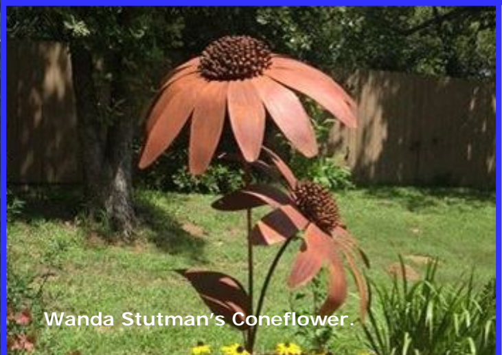
Wanda Stutman's Coneflower.