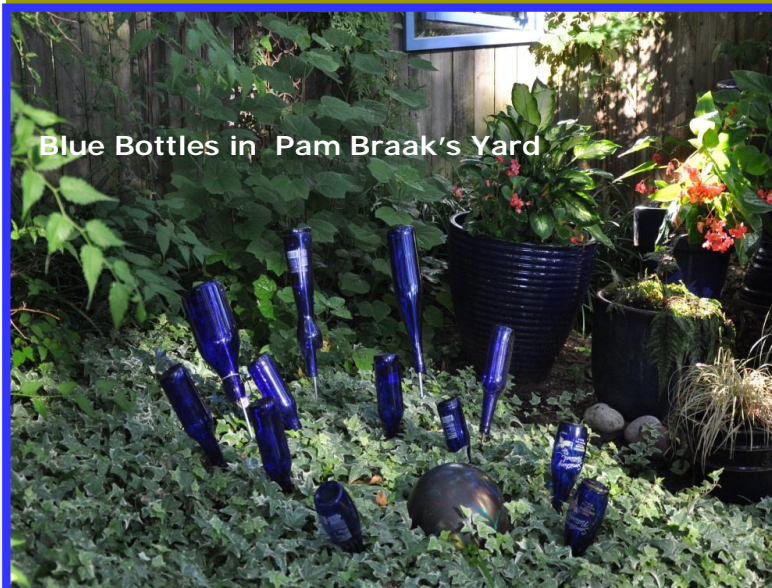
Blue Bottles in Pam Braak's Yard