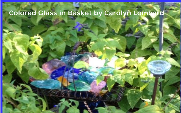
Colored Glass in Basket by Carolyn Lombard