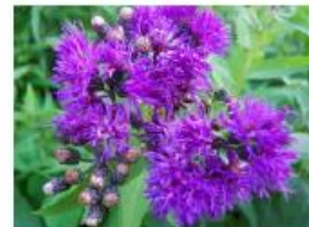
Vernonia baldwinii Western Ironweed

Where: Randol Mill Park Greenhouse 1901 W Randol Mill Rd. Arlington, TX (The greenhouse is in the rear of the park behind the swimming pool.)